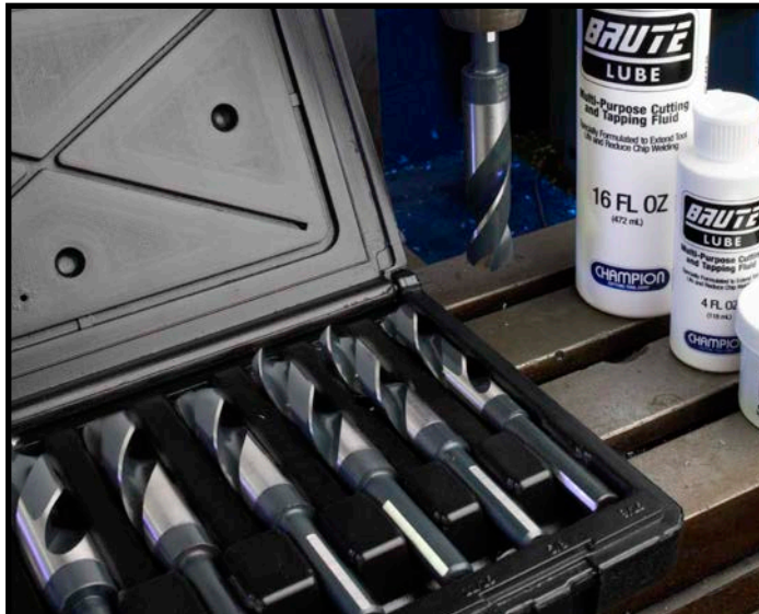
XL28 reduced overall length for extra strength

Application: Ideal for the aircraft industry. Used for the drilling of high tensile martensitic stainless steels, titanium alloys and hard steel.