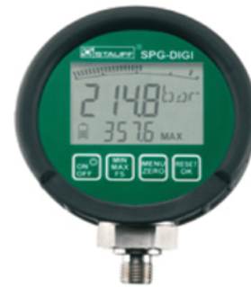
PART NO: SPG-DIGI-B0400-U