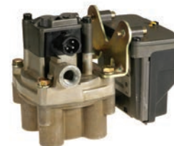
Bendix® A-18™ Trailer ABS

See PNU-109 for additional A-18 module piece numbers.