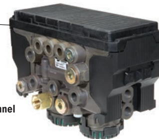
Bendix® TABS-6™ Advanced Multi-Channel Trailer ABS