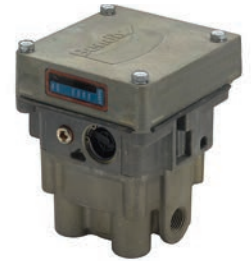
Bendix® MC-12™ Trailer ABS

See PNU-110 for MC-12 module piece numbers.