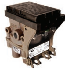
Bendix® TABS-6™ Trailer ABS