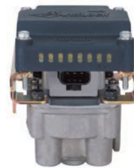
Bendix® MC-30™ Trailer ABS

See PNU-161 for MC-30 module piece numbers.