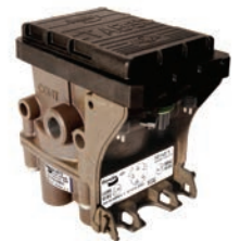
Bendix® TABS-6™ Trailer ABS