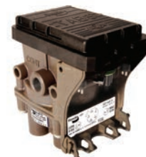
Bendix® TABS-6™ Trailer ABS