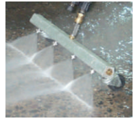
AU-WB123G .....3 nozzles AU-WB164G .....4 nozzles