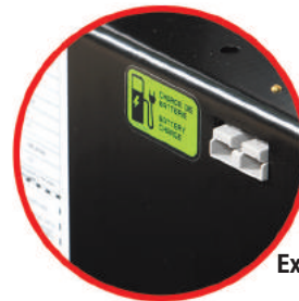
External battery charger