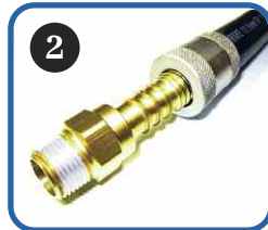
2 Push Stem and Screw to Start