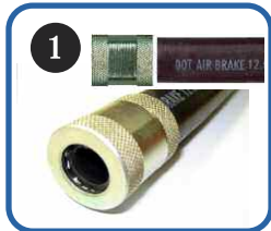
1 Thread Shell On Hose