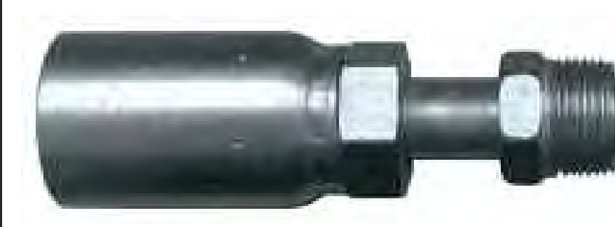
S.A.E. 45° Inverted Flare (Swivel)