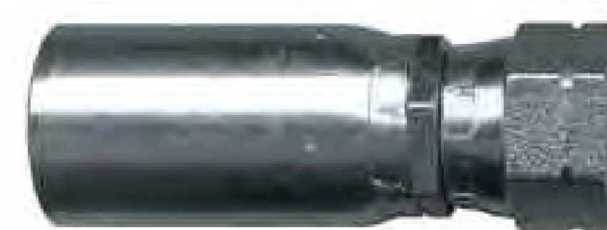
S.A.E. 45° Female Flare (Swivel)