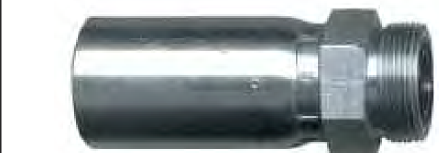
Male O-Ring Face Seal