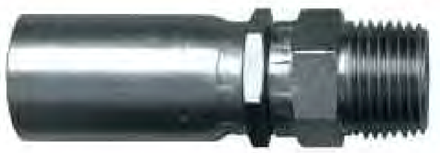
Male Pipe (Working Swivel)