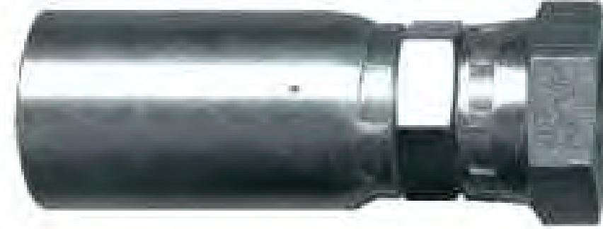
Female N.P.S.M. Pipe (Swivel)