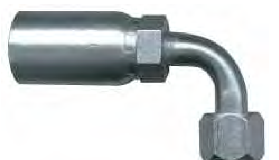
90° ELBOW British Standard Parallel Pipe Female (Swivel) (BSPP)