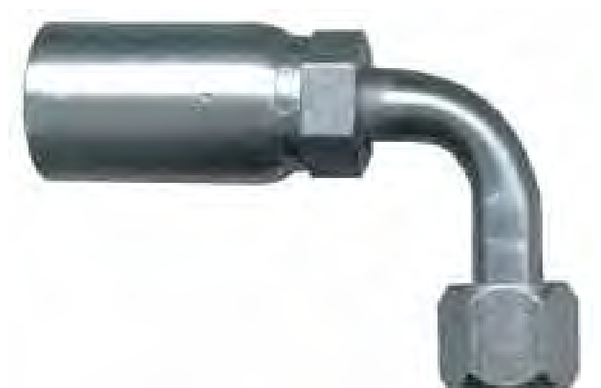
90° ELBOW (LONG STYLE) S.A.E. 37° Female Flare (Swivel)