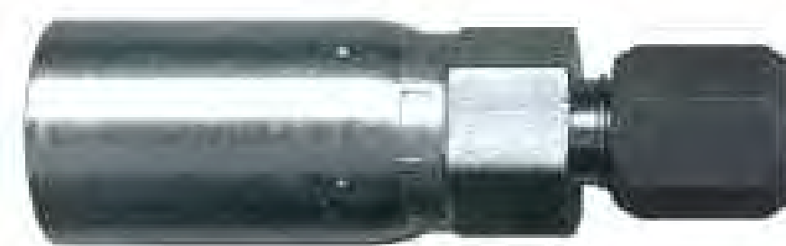
Tube Repair (Flareless)