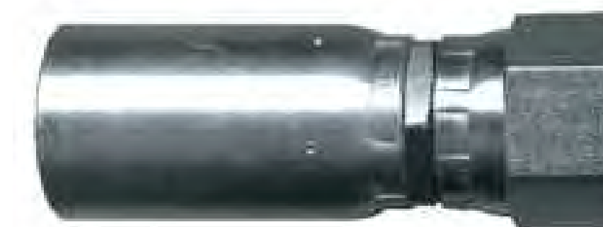
S.A.E. 37° Female Flare (Swivel)