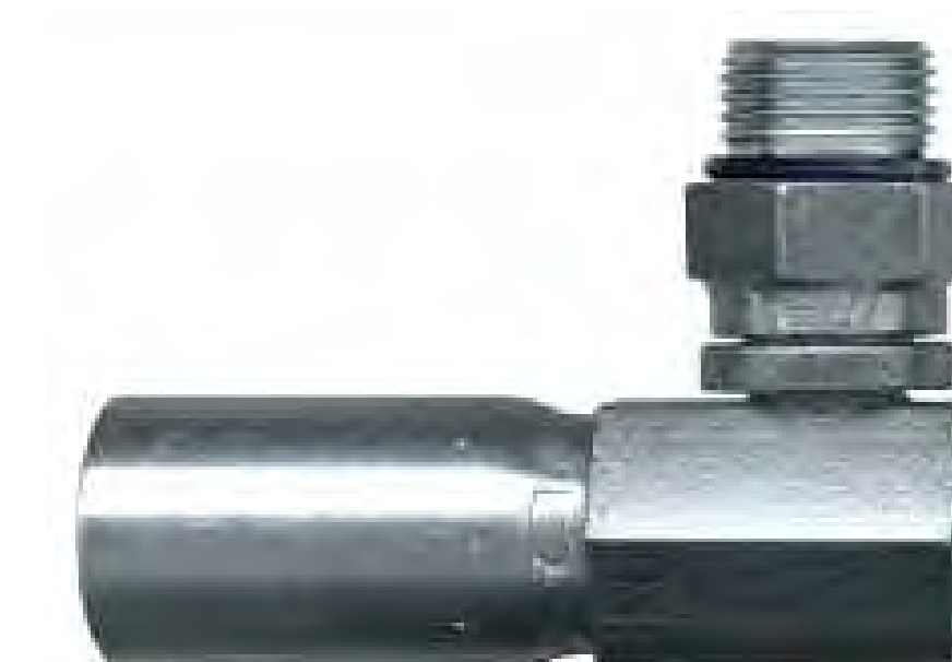
90° ELBOW Male O-Ring Boss (Working Swivel)