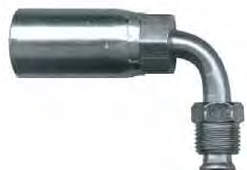
90° ELBOW S.A.E. 45° Inverted Flare (Swivel)