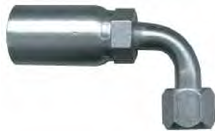
90° ELBOW S.A.E. 37° Female Flare (Swivel)