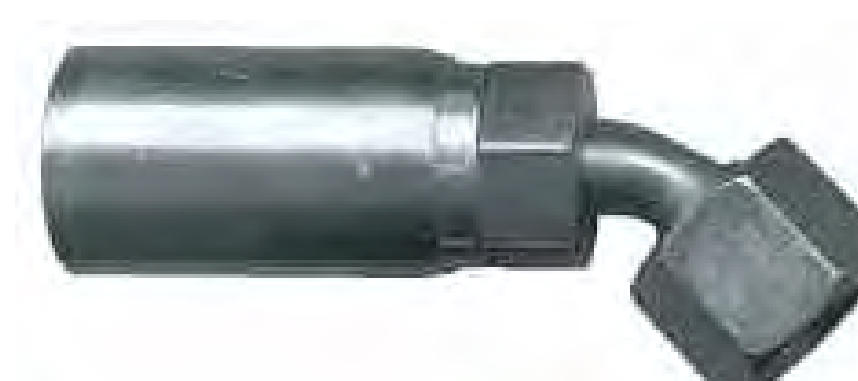
45° ELBOW Female O-Ring Face Seal (Swivel)