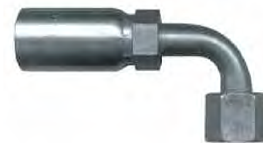
90° ELBOW Female O-Ring Face Seal (Swivel)