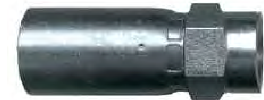
Female (Grease Tap)