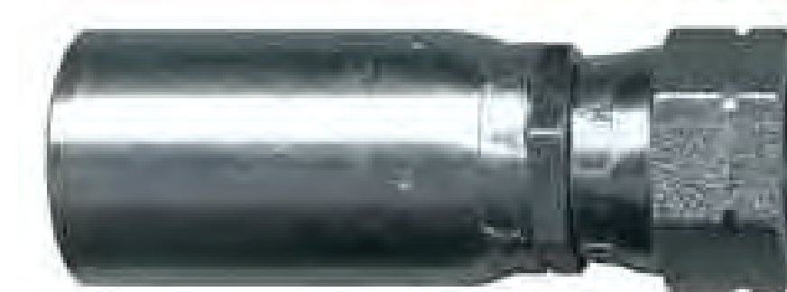
British Standard Pipe Parallel Female (Swivel) (BSPP)