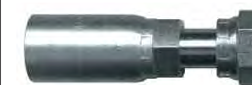
Female O-Ring Face Seal (Swivel)