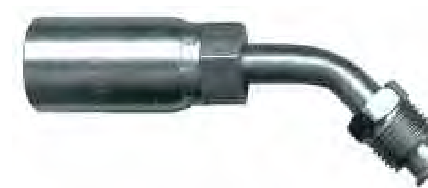
45° ELBOW S.A.E. 45° Inverted Flare (Swivel)