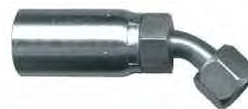
45° ELBOW S.A.E. 37° Female Flare (Swivel)