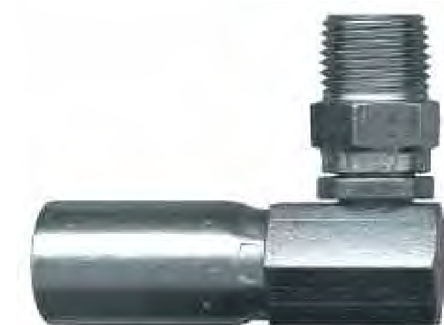
90° ELBOW Male Pipe (Working Swivel)