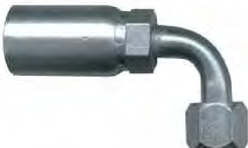
90° ELBOW S.A.E. 45° Female Flare (Swivel)