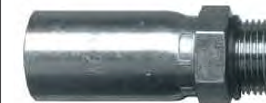
Male O-Ring Boss