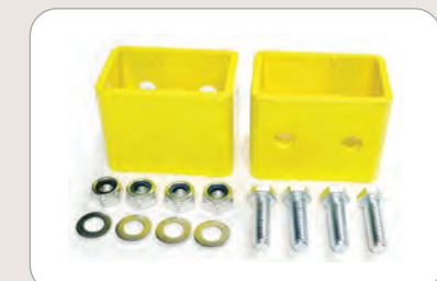
50491-10 Van Trailer Bracket Kit Mounts under the rear door of van trailers to allow use of the flatbed ladder.