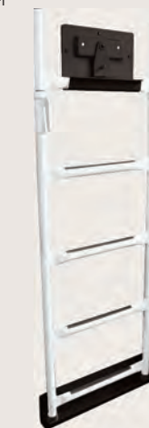
Storage Bracket Kit with Ladder in Place and Padlocked