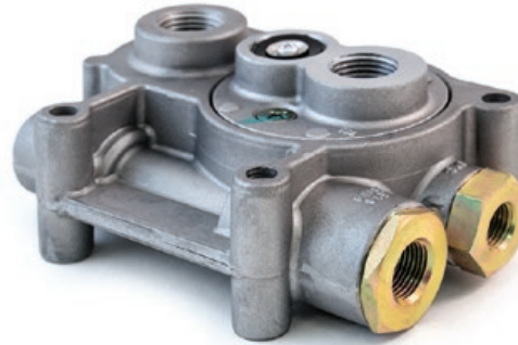
TP-5 STYLE TRACTOR PROTECTION VALVE Replaces Control Valve Manifold