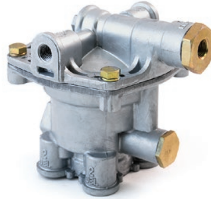
RELAY EMERGENCY VALVE With Ratio Feature