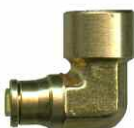
90° ELBOW Tube To Female Pipe