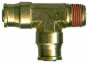
TEE Ends Tube and Male Pipe Center Tube

D.O.T. RECOGNIZED FOR ALL AIR BRAKE APPLICATIONS EXCEPT THOSE FOR USE BETWEEN FRAME AND AXLE OR BETWEEN TOWED AND TOWING VEHICLES.