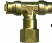
TEE Ends Tube Center Female Pipe Swivel