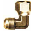
90° ELBOW Tube To Swivel Female Flare