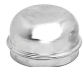
TYPICAL AGRICULTURAL CAP