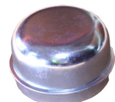
TYPICAL CLOSED CAP