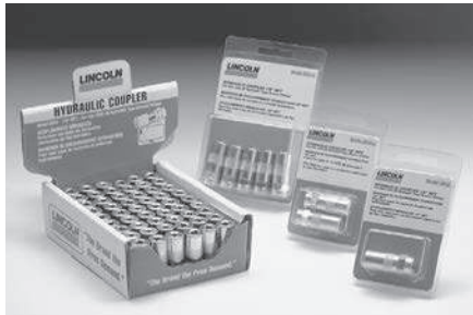
Hydraulic coupler displays